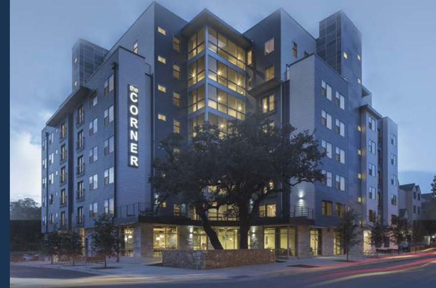
THE CORNER Austin, Texas

4M Sq. Ft. of Student Housing since 2013